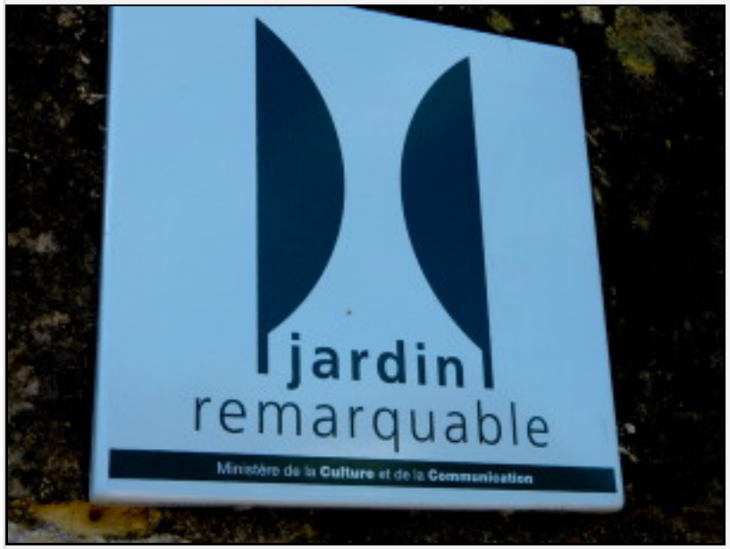
In a unique move, the entire village of Chedigny was designated a "Remarkable Garden."

New Brunswick King's Landing – colonial American history comes alive