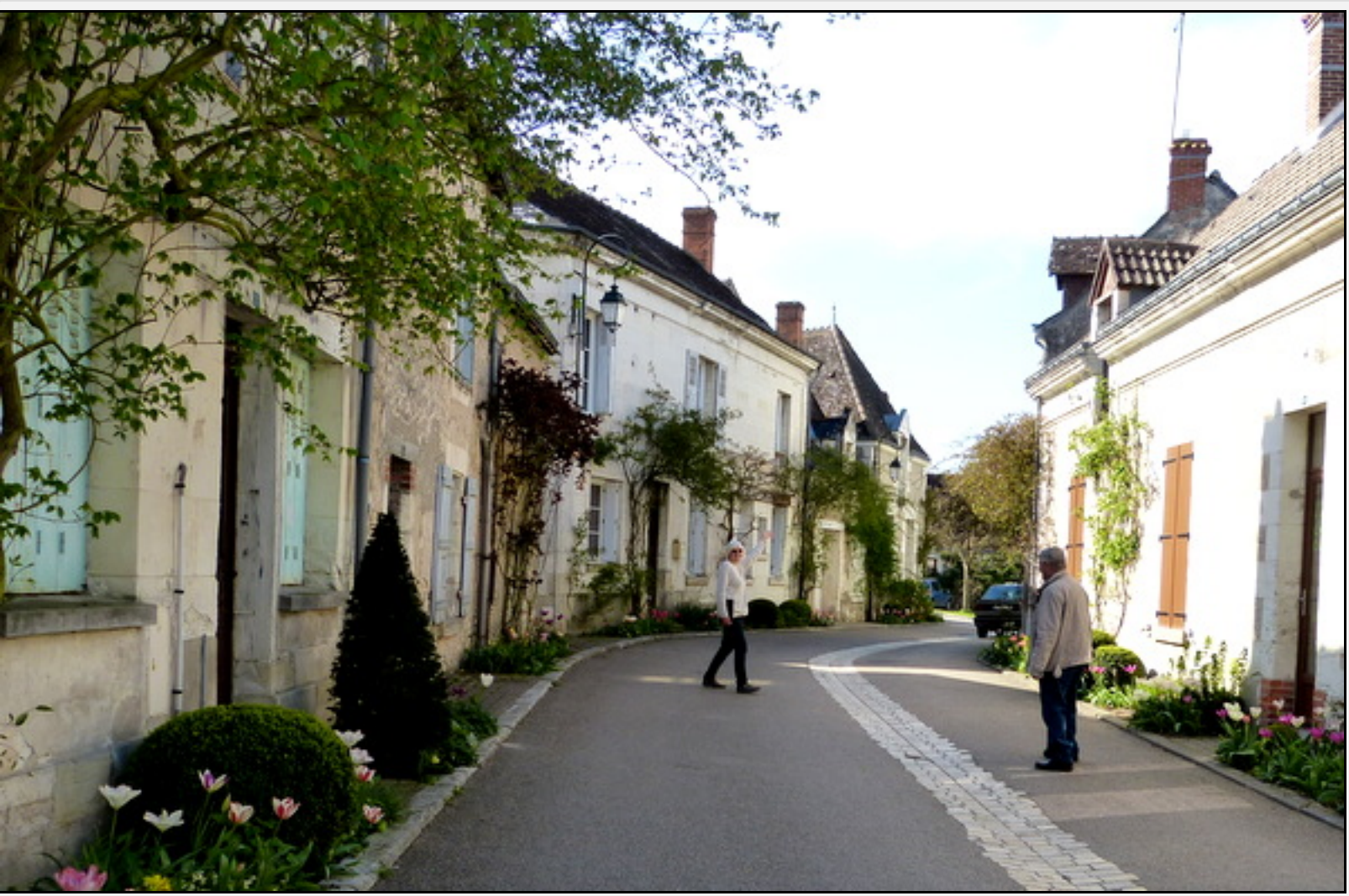
The Loire Valley village of Chedigny, in its entirety, is a designated Remarkable Garden."

Perhaps I wasn't on the right road, even though my GPS assured that was so. Rolling hills with fields of yellow rapeseed and green grains stretched on either side of the one-way lane, with nary a church steeple in sight.