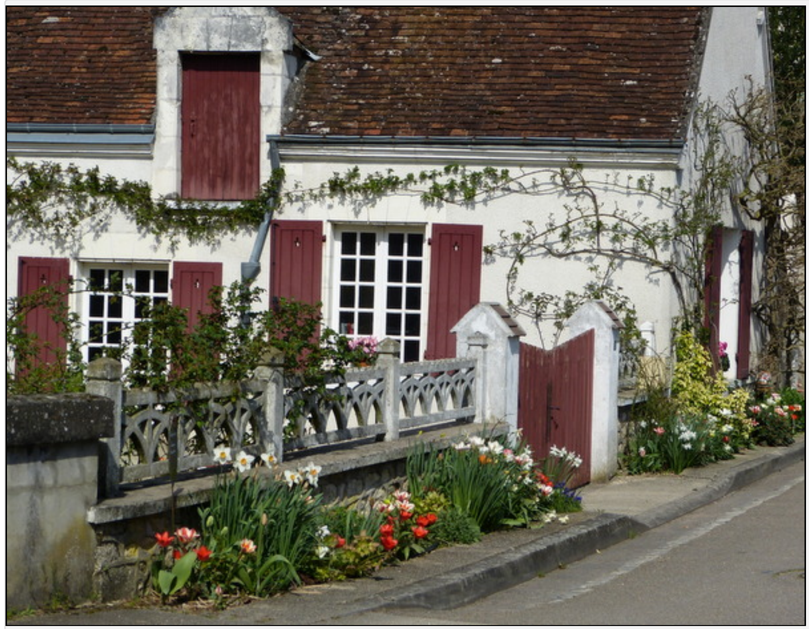
As the village's beautification plan went underway, homeowners began to spruce up their gardens.