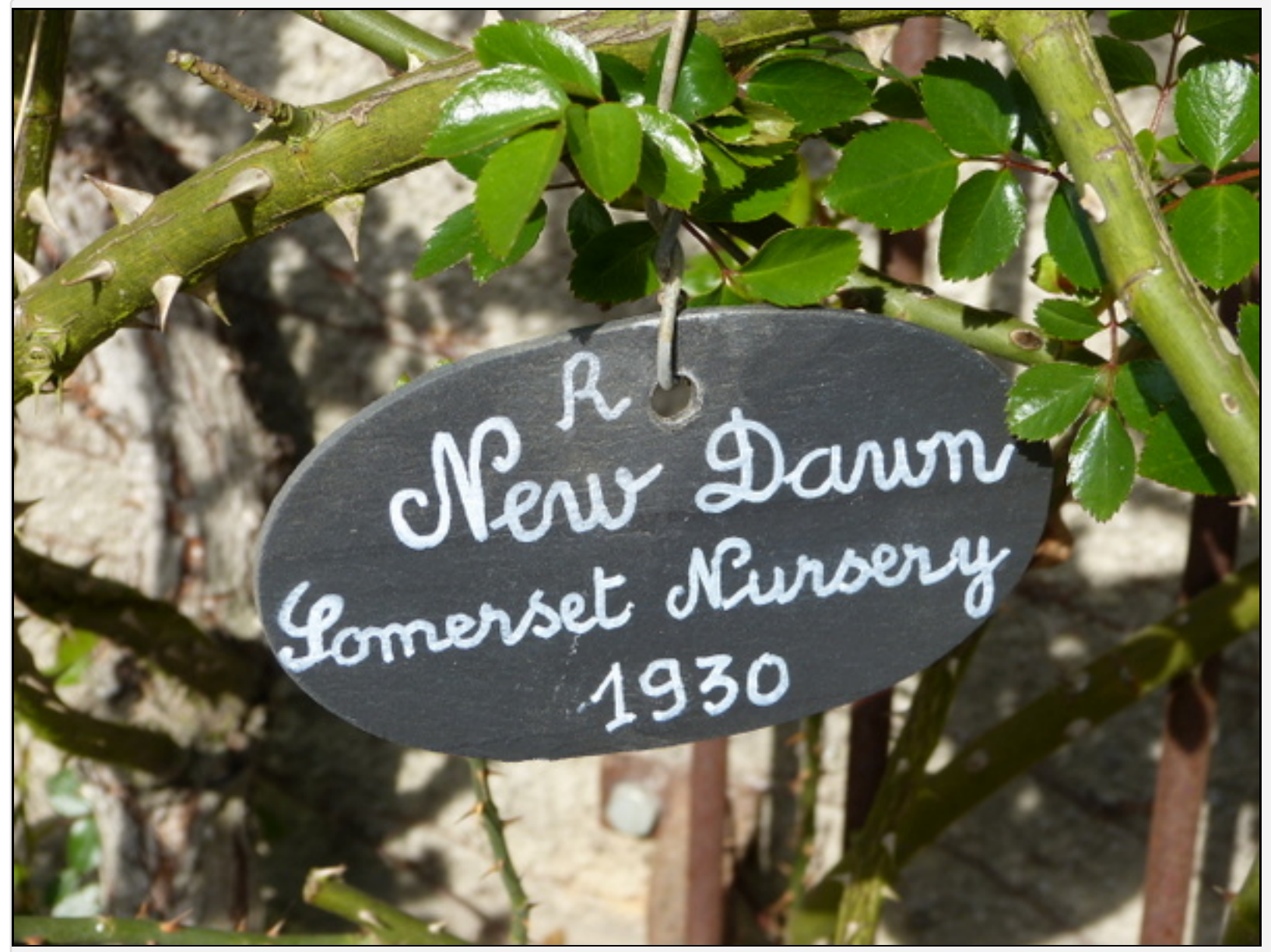
Heritage roses are labeled with the date of their introduction to Chedigny.

The planting of 700 rose bushes went underway –espaliered against building walls, trellised to cross the waterway in rose-arched canopies, planted in front of the town hall, bookstore, artisan shops. Today the number of roses in the tiny village has expanded to more than 800 representing 270 tried-and-true heritage varieties – each carefully labeled as to the year of their introduction into the rosario world.